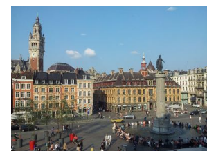
Lille 'Place Général de Gaulle'

90 minutes from London 60 minutes from Paris 45 minutes from Brussels