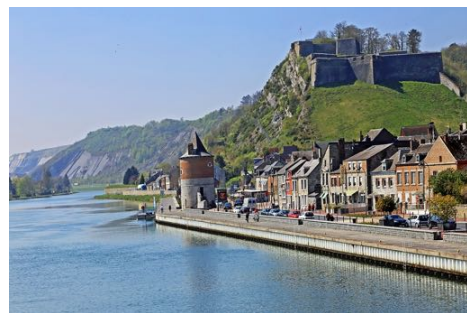
Devonian type section of Givet, Meuse Valley