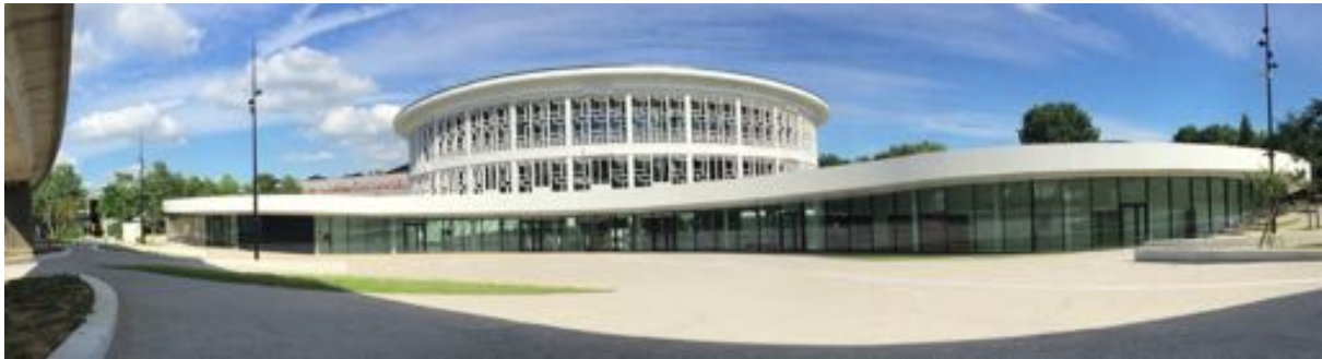
The new Lilliad buildings (Lille University Learning Center) on the Campus 'Cité Scientifique' at Villeneuve d'Ascq

The indoor sessions with keynote talks and regular lectures (partly scheduled online) will take place in the new Congress Centre of Lille University 'Lilliad' on the Campus of the Cité Scientifique (Science Campus) at Villeneuve d'Ascq (15 minutes by metro from Lille city centre). They are scheduled from Tuesday, July 11 th to Thursday, July 13 th 2023. Plenary and parallel sessions will take place, with numerous workshops and business meetings in smaller rooms available to all subcommissions of the ICS.