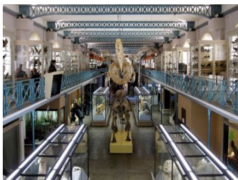
Musée d'Histoire Naturelle

Social activities include the icebreaker party and reception on Monday July 10 th , as well as a visit to the Natural History Museum Lille , and a conference dinner that will be organized on Wednesday, July 12 th , at the Hermitage Gantois, an ancient hospice of the late 15 th Century.