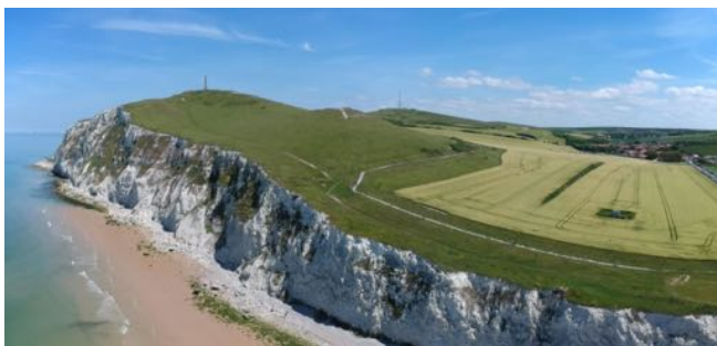
Cretaceous cliffs of the Cap Blanc Nez – Côte d'Opale

Belgian Classics: Devonian-Carboniferous of southern Belgium and northern France