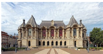
Palais des Beaux Arts

Lille, capital of the French Flanders, is located in the northernmost part of France. As a major Flemish city, like the nearby cities of Ghent and Bruges (Belgium), Lille has a complex history as it was the object of quarrel between the Counts of Flanders and the Kings of France during centuries. Lille also belonged to Austria and Spain, before becoming French in the late 17 th century. Lille is therefore ideally located at the major crossroads of north-western Europe. Although Lille has an international airport, it is very convenient to travel to one of the major international airports in Paris (France), Brussels (Belgium), or London (UK). High speed train connections are regular and very practical, with very short travel times to Lille. Hotels and restaurants are available in all price categories, mostly in walking distance from the metro and train stations.