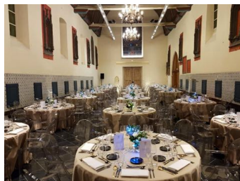
Salle des Hospices