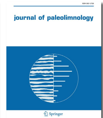
Journal of Paleolimnology